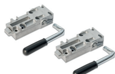
AC-170 2 Unlocking system with leverage