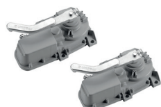
EAGLE 24V/230V 2 Motors Eagle